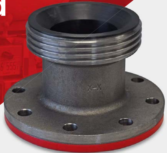
Part Number: HSHU4FXF206

Designed specifically for the transfer of corrosive liquids, the UHMWPE lined hammer union allows for superior performance in a variety of applications.